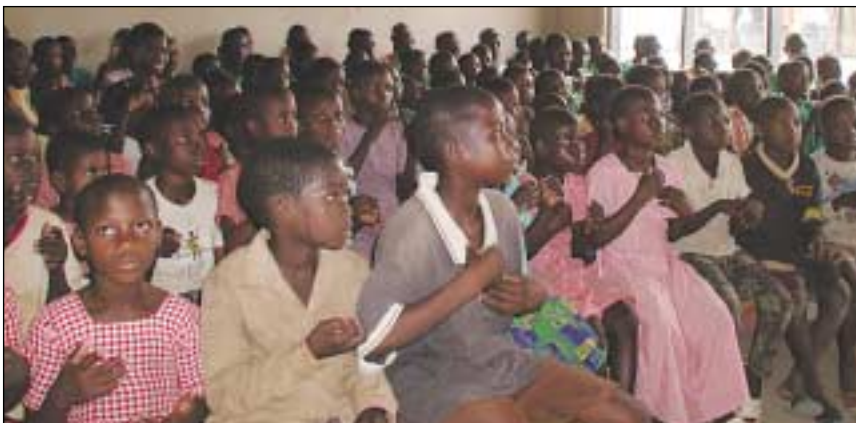
The children joined the team in singing, by signing, Jesus Loves Me.