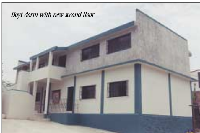
Boys' dorm with new second floor

The invitation arrived from Hearts of the Father Outreach for the dedication of the new boys' dormitory and water tank at Casa Hogar. We were excited because many people from our town of Shelter