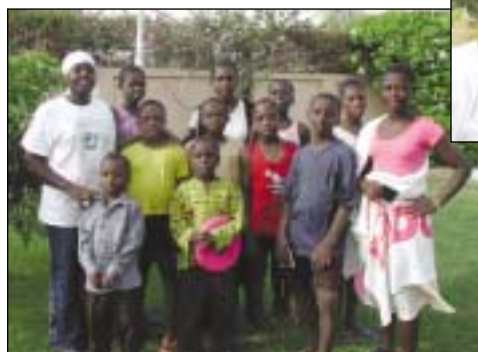
Children of the JoshKrisDan Home in Old Ningo